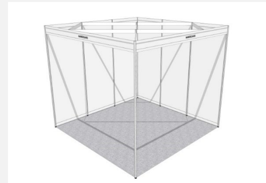
PICTURED: 3x3 corner shell scheme booth